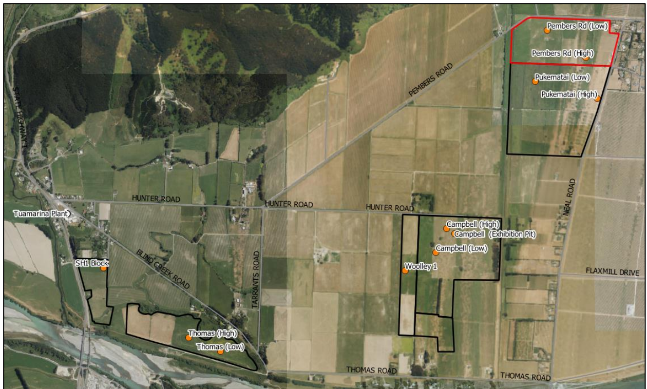
Figure 1: Location of Sites and Test Pits

A desktop and field survey of soil type distribution was undertaken. Surface water flow paths, waterways and wet areas were identified. This desktop investigation was then either modified or confirmed based on field surveys. At each of the proposed sites, a walkover was performed to map surface features and drainage paths, and ten test pits were dug using an excavator across the multiple third-party farms for soil profile descriptions.