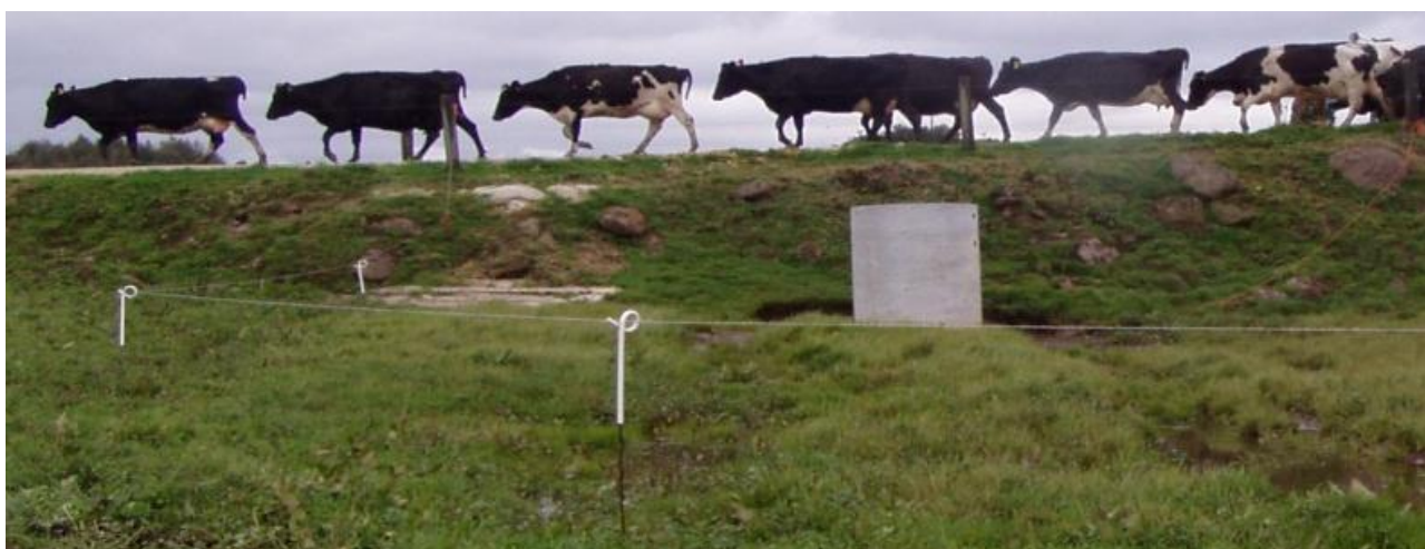
Figure 8: An example of good management of a DB in the Awahou Stream catchment as the ponding area has been temporarily fenced off from stock during wet periods.

There are several best management practices (BMPs) which can be followed when managing DBs. In the long term, DB basins are likely to be a P-sink so there may be no need for application of P fertiliser within the ponding area (Clarke, 2013). However, there may be a need for addition of readily-leached nutrients such as nitrogen and sulphur (A. Roberts, Ravensdown, Pers. comm. , 2012). Best practice in farming in New Zealand often involves the use of a spatially applied nutrient budgeting model (e.g. OVERSEER®) where a farm's various land management units or blocks are separately assessed for nutrient application, uptake and loss. The DB ponding areas could be treated as separate blocks in such nutrient budgeting models and lead to more efficient fertiliser application strategy in the farm's nutrient management planning. During wet periods it is advised to exclude stock from the ponding area, as shown in Figure 8.