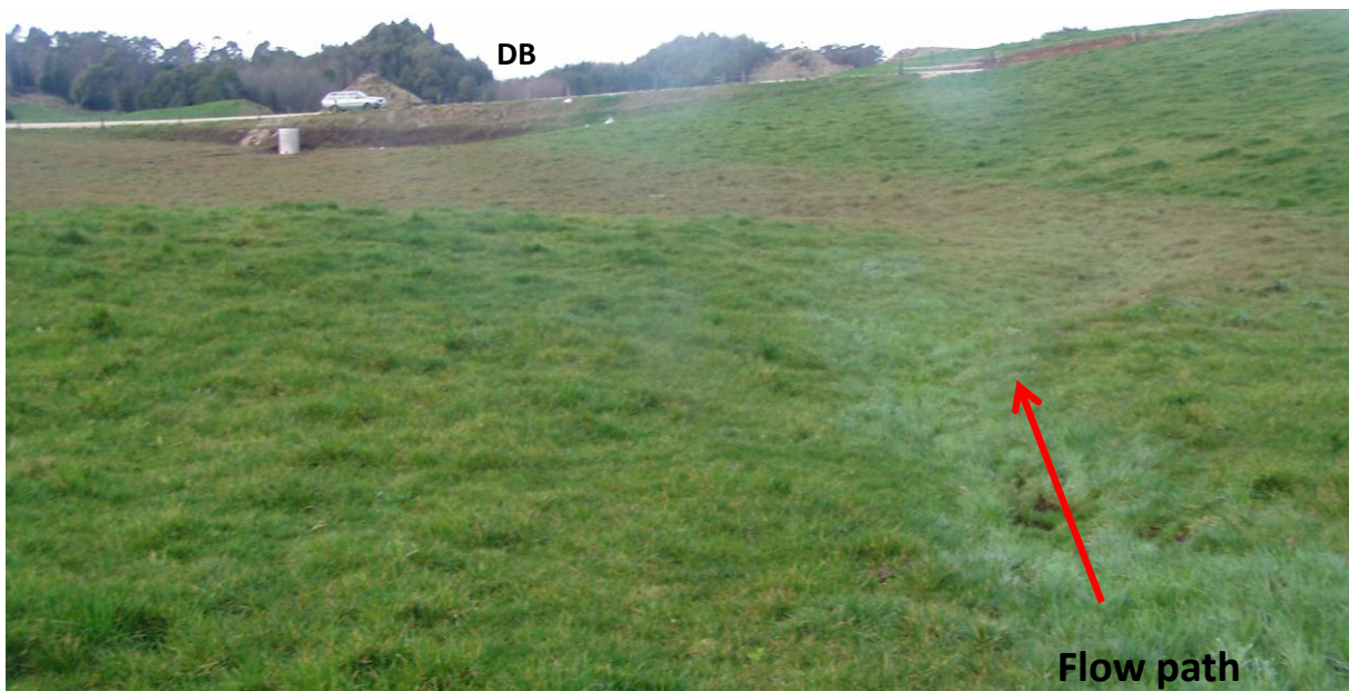
Figure 4: Evidence of sediment retention (visible on grass) after a ponding event at a detainment bund in the Awahou Stream catchment, July 2012. Note the ephemeral stream flow path (depicted by the arrow) in the foreground is completely clean.

Detainment bunds have been specifically designed to be readily adapted to farm systems. In order to maintain pastoral production, DBs have been designed and operated to allow ponding of storm water for no more than three days (Figure 4). This is a compromise between