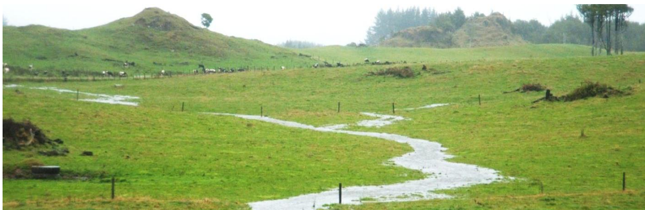
Figure 1: Overland flow in pastoral farmland in the Waiteti Stream catchment (a sub catchment of Lake Rotorua) after an intense rainfall event. This stream is entirely ephemeral as these paddocks are usually dry.

Diffuse-source phosphorus (P) loss from pastoral farmland via surface runoff is a challenging issue for land managers across the globe. Surface runoff (overland flow/ephemeral streams) is generated during rainfall when soil is saturated or infiltration capacity has been met (Figures 1 and 2). These ephemeral flows form in paddocks which are usually dry and they usually only flow for short periods of time (e.g. hours) in direct response to high intensity rainfall. They have the potential to transport a disproportionately large amount of sediment and nutrients from farm systems over short periods of time depending on land use in the contributing catchment.