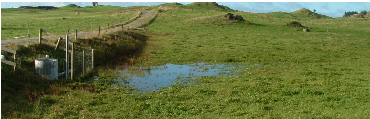
Figure 6: Residual water following a large ponding event at a detainment bund in the Waiteti Stream catchment, Rotorua. Note that the pasture appears undamaged. Photo: D. Clarke 2012.