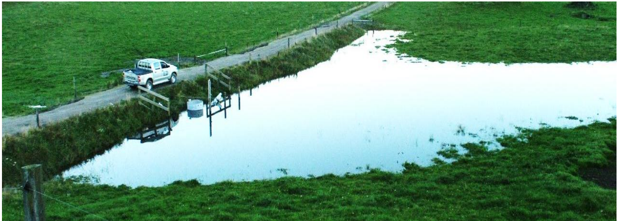
Figure 3: A typical detainment bund in the Lake Rotorua catchment. Water has ponded behind the bund following a heavy rainfall event which produced surface runoff. This ponded water is slowly draining through the bund's outlet control structure while sediment and particulate nutrients settle from suspension. Photo: D. Clarke 2012.

Detainment bunds temporarily pond ephemeral water behind an earth bund (c.1.5 m high) (Figure 3) for the purpose of allowing suspended sediment and associated nutrients to settle from suspension onto the pasture and become part of the soil matrix. Figure 4 shows an example of a DB basin after a ponding event. Clear evidence of sediment deposition can be seen where the water has ponded, but no sediment is retained in the ephemeral flow path.