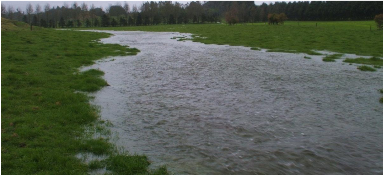
Figure 2: A large ephemeral stream in the upper Hauraki Stream catchment (a sub catchment of Lake Rotorua).

There is a range of mitigation tools available for attenuating nutrient and sediment loss via overland flow, each with strengths, weaknesses and variable cost effectiveness (McDowell & Nash 2012). Treating the large volume of water leaving a catchment during runoff events presents a challenge and many mitigation approaches struggle to cope with such large discharges over short periods of time. For example, ‘break points’ in riparian buffer strips can form where ephemeral flow paths intercept perpendicular to the strip and volumes are too great for water velocity to be reduced substantially by the vegetation, resulting in channelized flow through the riparian attenuation area (Cooper et al. 1990; Owens et al. 2007; Verstraeten et al. 2006). Grass filter strips can be effective for treating overland flow as long as water height is below the height of the grass. Once this height is exceeded then attenuation performance is reduced as grass is flattened (Cooper et al. 1990). Constructed wetlands often have a flood water diversion channels to avoid flood water inundation and damage such as at the large constructed wetland upstream of Lake Okaro in the Bay of Plenty (Tanner, 2003). If storm water is temporarily stored in upper catchment areas, then the above mentioned mitigation tools (and others) would potentially have a greater capacity to remove sediment and associated nutrients from water in overland flow.